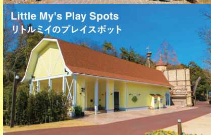
Little My's Play Spots リトルミイのプレイスポット