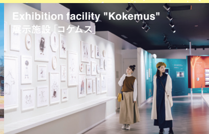
Exhibition facility "Kokemus" 展示施設「コケムス」