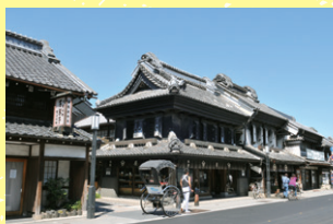
SS 29 Hon-Kawagoe 本川越