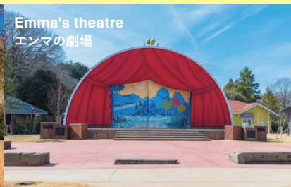
Emma's theatre エンマの劇場