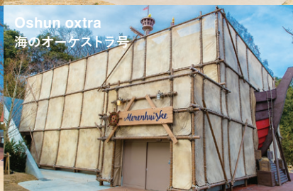
Oshun extra 海のオーケストラ亭