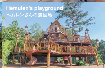
Hemulen's playground ヘムレンさんの遊園地