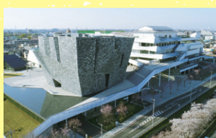
SS 22 SI 17 Tokorozawa 所沢