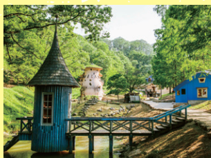
SI 25 Motokaji 元加治